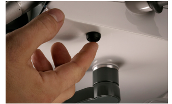
Figure 1: XO Configuration switch

Where two identical instruments have been installed (eg. 2 micro motors), the configured data will apply to both (eg. amount of spray water).