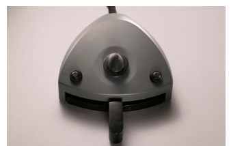
Figure 3: XO Foot Control