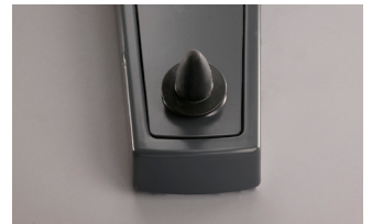
Figure 2: XO Joystick